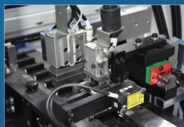
Press fit mechanism

COPYRIGHT © 2025 GEREKE. ALL RIGHTS RESERVED